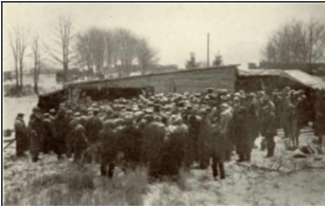
County Nonpartisan League Meeting held in machinery shed at Echo, Minnesota, because of refusal to allow meeting in town.