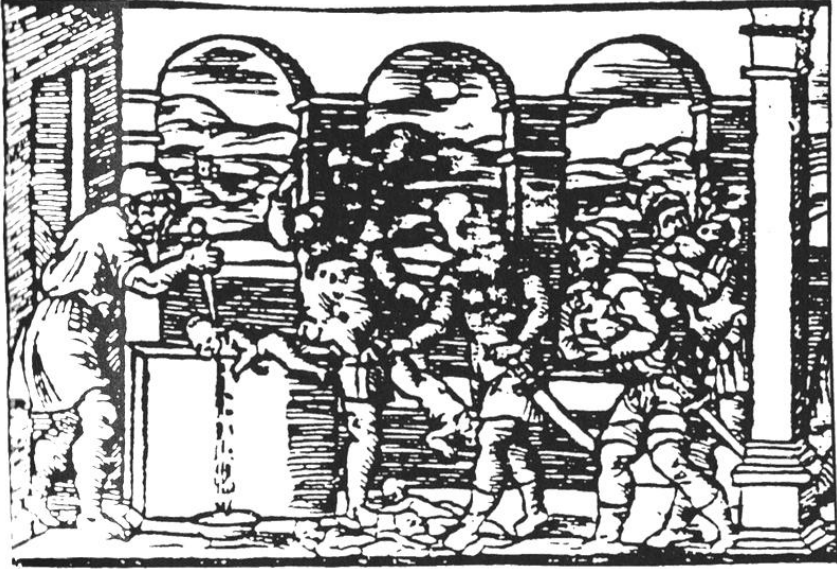
Fig. 5. The Pharaoh's Bath of Blood , woodcut from the Passover Haggadah , Mantua, Giacomo Rufinelli, 1560 (detail).