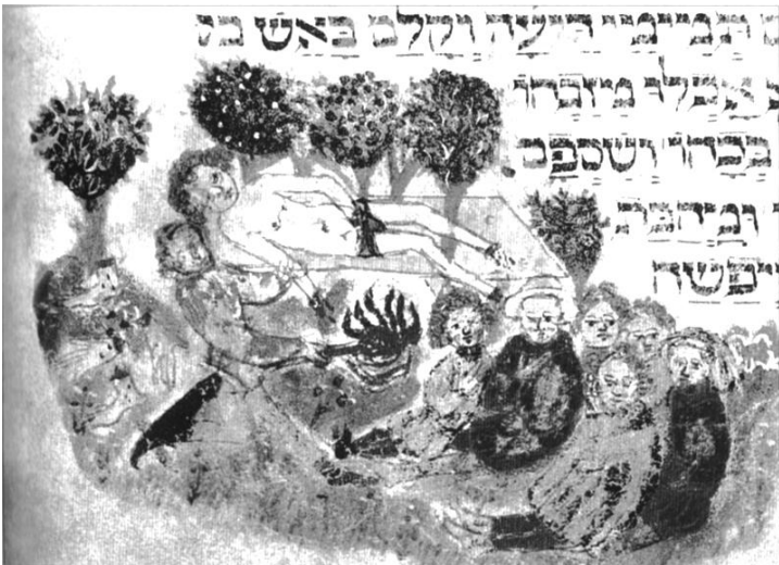
Fig. 14. German Jew Tortured with Fire , miniature from Jewish Code 37 from the Hamburg State and University Library (c. 79r).