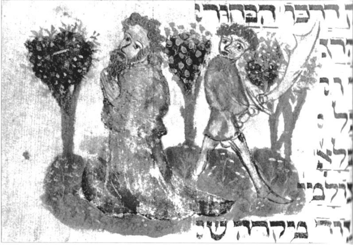
Fig. 13. German Jew Being Executed with a Sword , miniature from Jewish Code 37 from the Hamburg State and University Library (c. 79r).