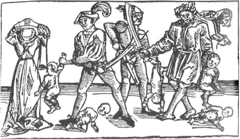
Fig. 3. The Massacre of the Innocents , woodcut from the Ultraquist Passional , Prague, Jan Camp, 1495.