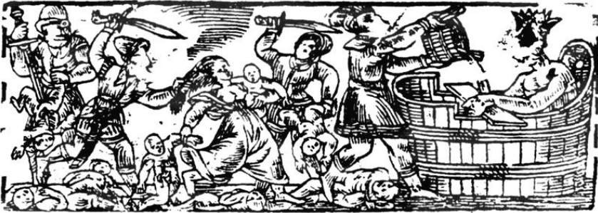
Fig. 2. The Pharaoh's Bath of Blood , woodcut from the Passover Haggadah, without publisher, circa 1580.

פרעם אין יידן קיכדר בלוט ער האט גיבארן : גאט און סולדיג בלוט ניט און גילאכן וויל לאן